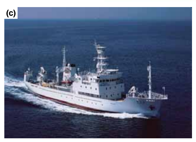
Figure 3. Prey surveys vessels. (a) Kaiyo-maru No.7 (KY7), (b) Takuyo-maru (TKY), (c) Shunyo-maru (SYO)