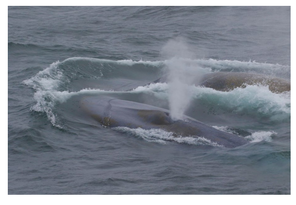
Blue whale breathing at sea surface (2022)