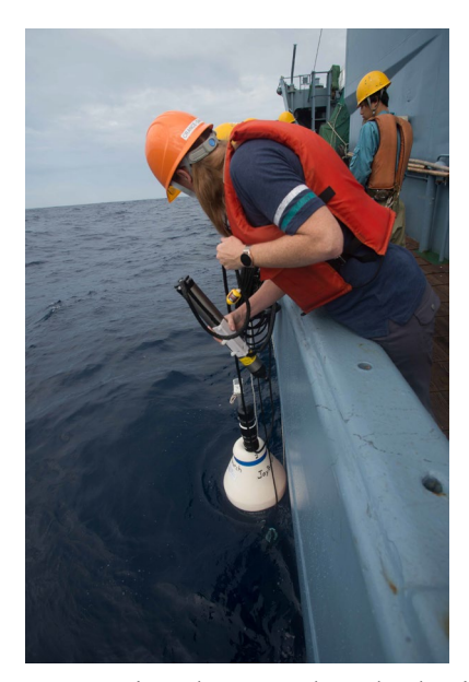
International researcher deploying U.S.-made acoustic observation equipment (2023)