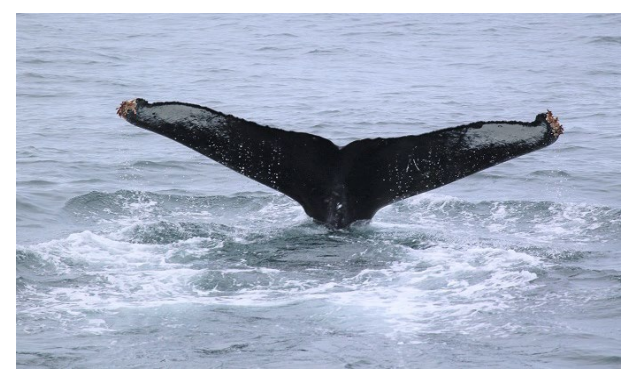
Caudal fin of a humpback whale photographed near the Aleutian Islands (2022)