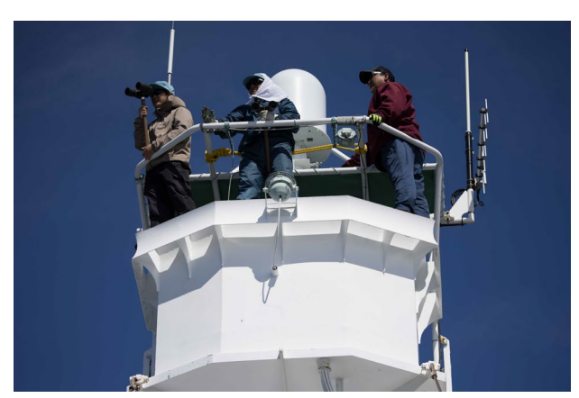
Observers and international researchers confirming whale species from the observation platform (2023)