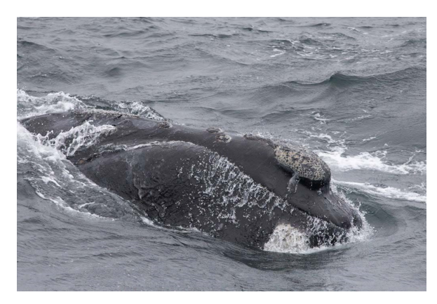
Head of a rare North Pacific rare whale (2023)