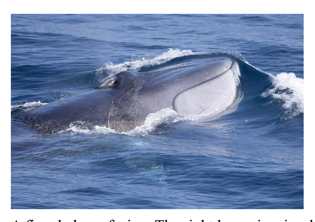
A fin whale surfacing. The right lower jaw is white (2023)