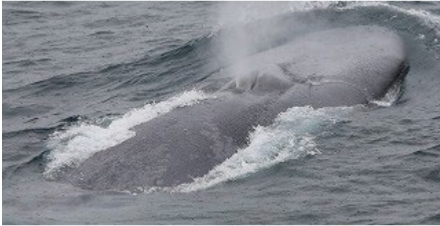
Blue whale breaching at sea surface (2021)

Photographs from previous IWC-POWER cruises.