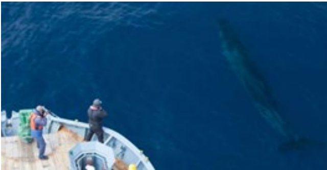
Biopsy sample collection from a sei whale (2020)