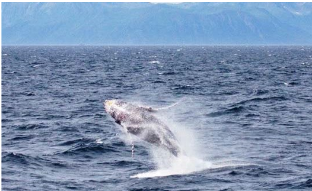
Humpback whale breaching in the Gulf of Alaska (2012)