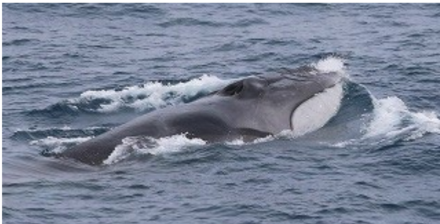
Fin whale surfacing (2021)