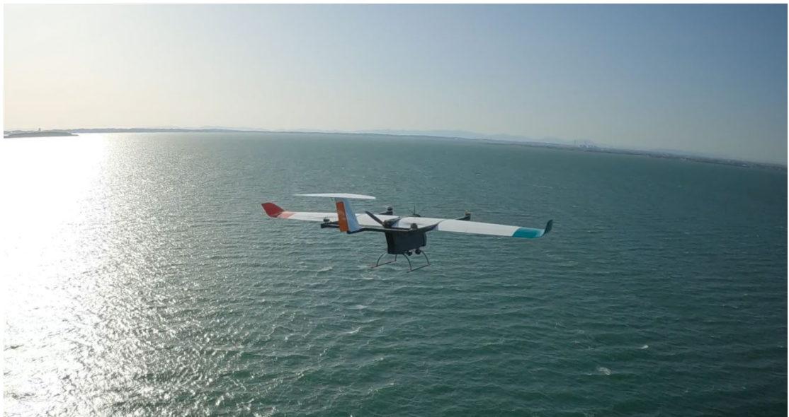
Photo 3. Another view of ASUKA in flight.