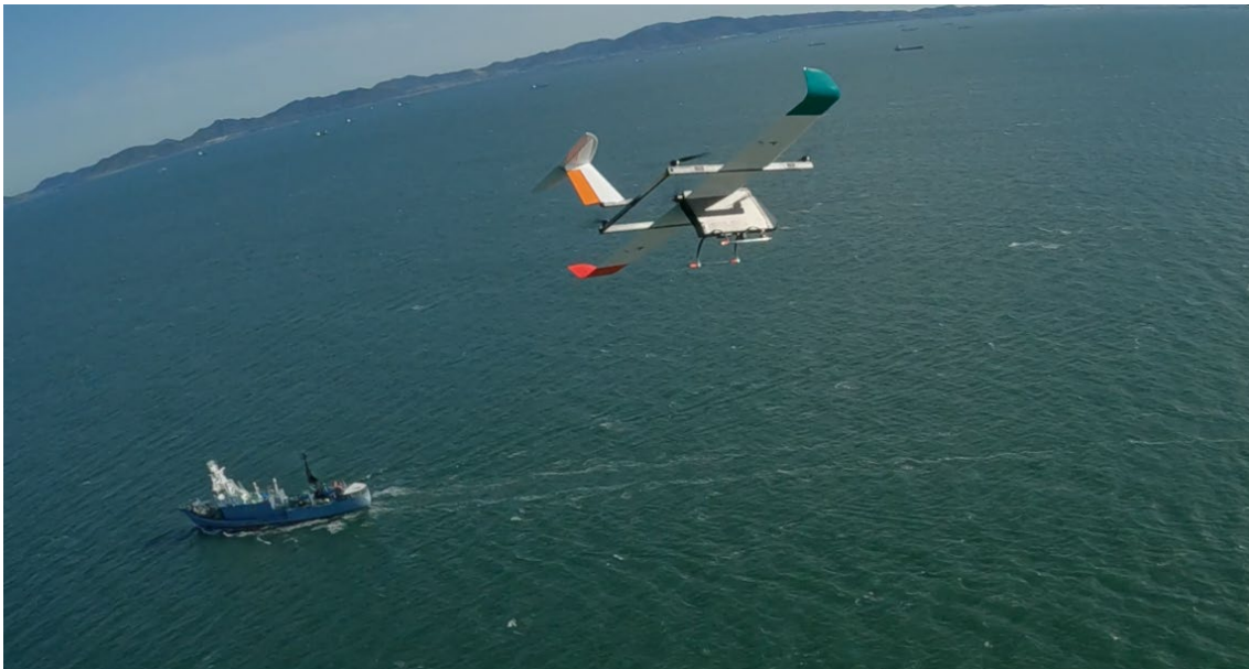
Photo 4. Another view of ASUKA returning to base. The research vessel is on the lower left.