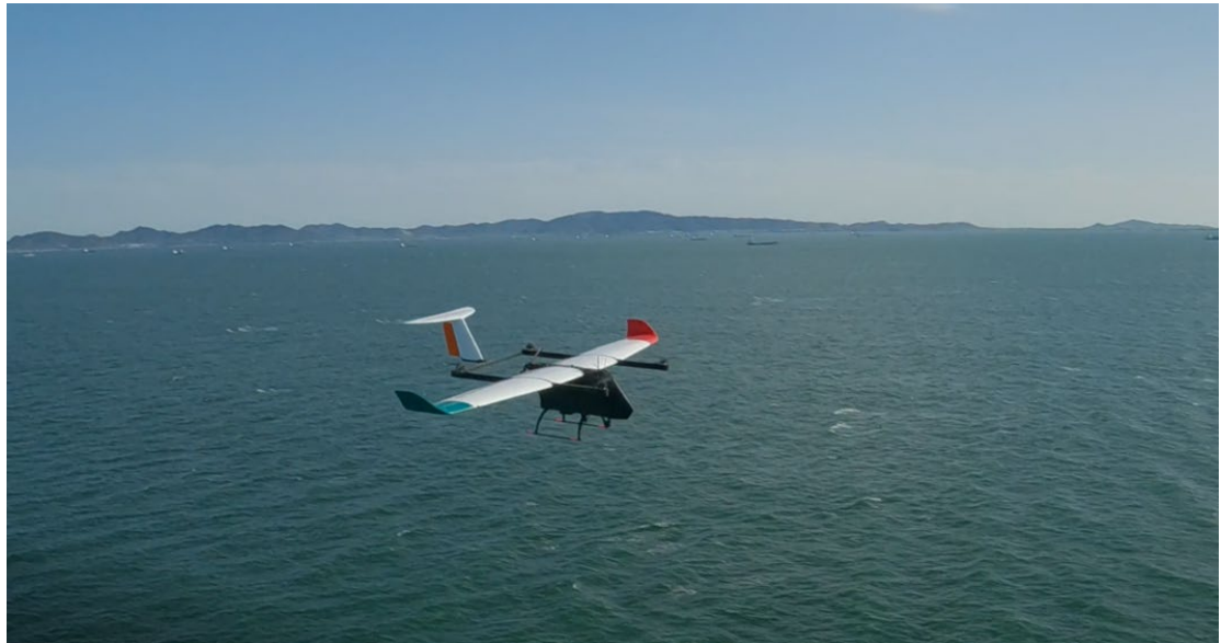
Photo 2. ASUKA flying over Mikawa Bay.