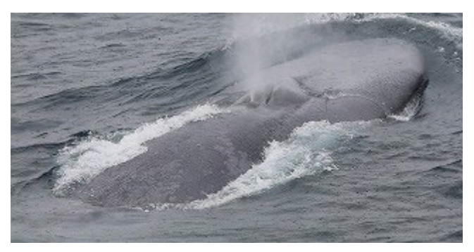
A blue whale breathing at the sea surface.

Photographs from the 2021 IWC-POWER cruise