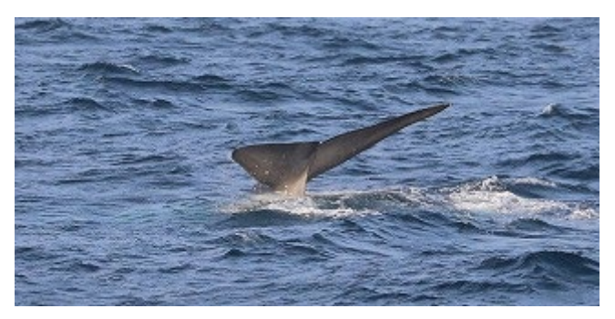
A blue whale shows its fluke and dives.