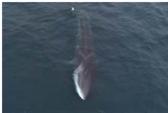
Fin whale showing characteristic white right side jaw (drone image)