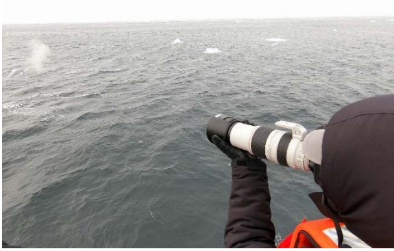
Taking individual identification photos (blue whale)