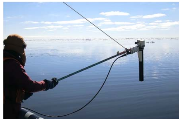
Oceanographic observation by XCTD