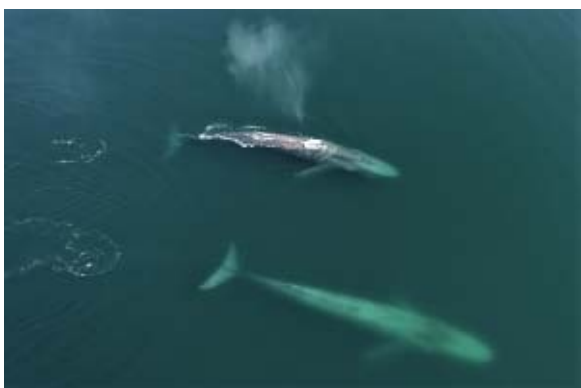
Blue whales (drone image)