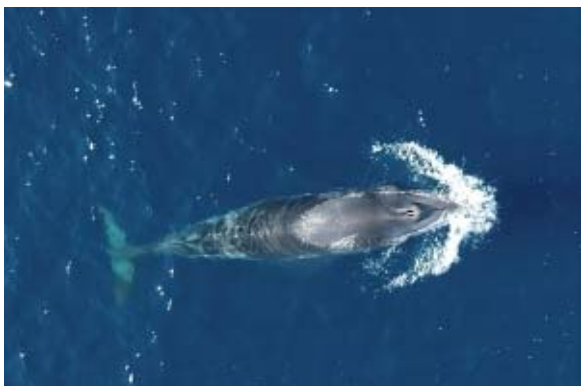
Antarctic minke whale (drone image)