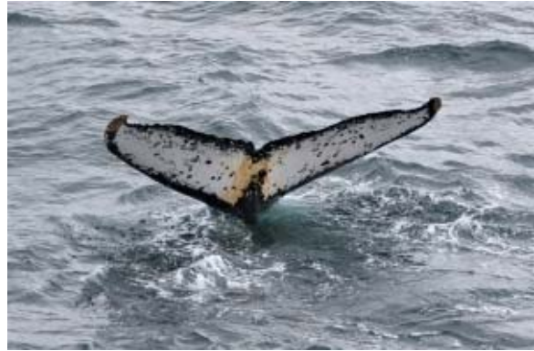
Example of individual identification photo (humpback whale)