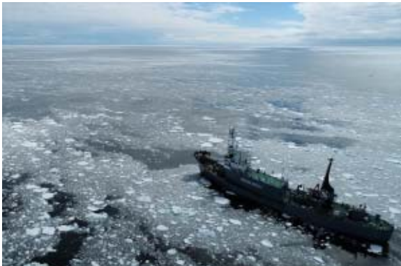
The Yushin-Maru No. 2 navigates through sea ice