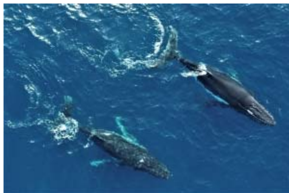
Humpback whales (drone image)