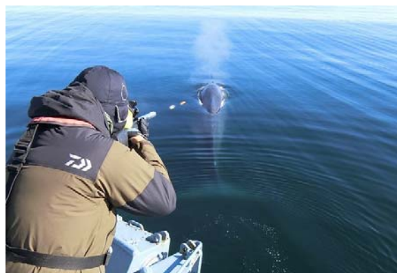
Scene from a biopsy experiment (blue whale)